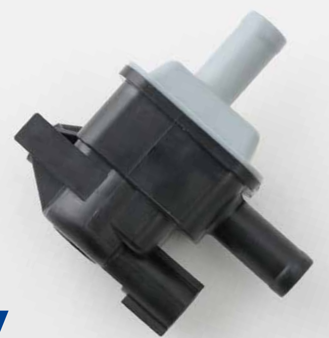
Duty Control Valve