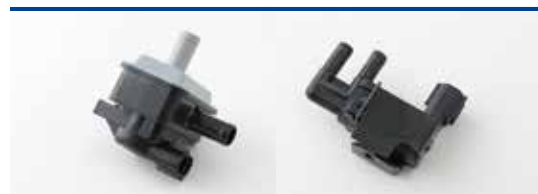
Duty Control Valve

By using HAMANAKODENSO's production technologies and manufacturing know-how, developed over many years of operation, we can realize the quality, cost, and delivery time our customers require.