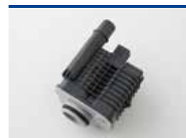
Evaporative Leak Check Module