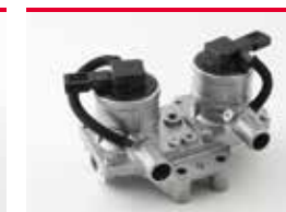
Electric Combination Valve