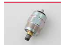
Fuel Cut Valve