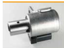
Oil Pressure Control Sorenoide

We offer solenoids and coils that control transmission shifting or braking by controlling the hydraulic pressure of an automatic transmission (AT) or anti-lock brake system (ABS).