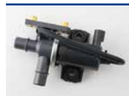
Vapor Containment Valve