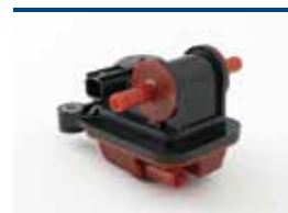
Integrated Purge Valve