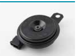
Disk Type Horn