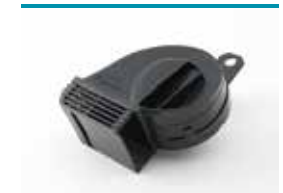
Trumpet Type Horn

A car horn is an acoustic device used as an alarm to notify a failure or danger to others. Our horn is not only incorporated in a car as a genuine part, but is also offered as an aftermarket part to be exchanged with a genuine part for its higher-quality sound.