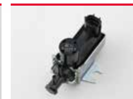
Electric Vacuum Regulating Valve