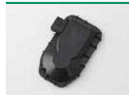
Non Contact Sensor:NCS

We offer many different sensors that perform controlling and correction functions in various situations, including checking engine coolant temperature or intake air temperature, and operational detection of the accelerator pedal or electronic throttles. As the vehicle's electronic control system becomes increasingly sophisticated, our products are needed in a wider array of applications.