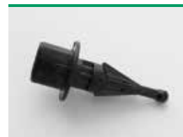
Intake Air Temperature Sensor