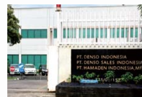
PT.HAMADEN INDONESIA MANUFACTURING

HAMANAKODENSO operates globally with three overseas production bases, while honing cutting-edge core technologies at its domestic bases. Maintaining global operations offers a wide-range of benefits, including an increased ability to respond quickly to requests from automakers and suppliers around the world, a reduction in logistics and production costs, and the dispersion of risks such as natural disasters and higher costs through multi-based production. We will promote "local production for local consumption" by further strengthening cooperation with DENSO, which has operation bases all over the world, and pursue efficient business operations through effective utilization and coordination of our business sites both within Japan and abroad.