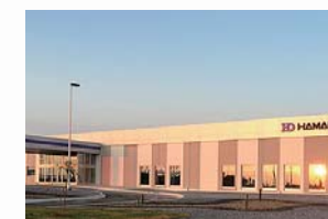
HAMADEN MEXICO S.A.DE C.V.